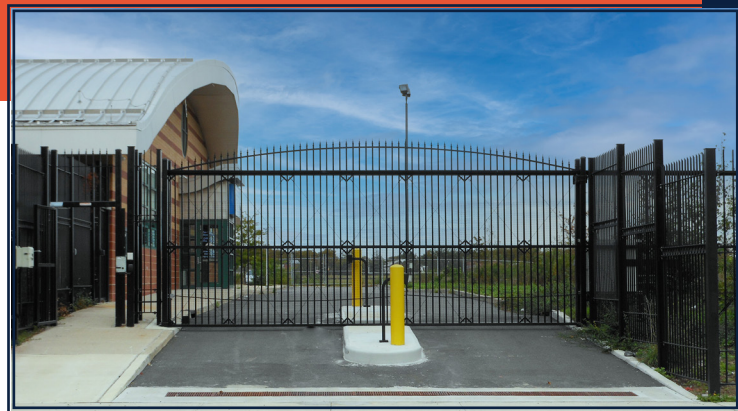
Available with fully integrated operator.

Cycle tested; performs reliably over time.