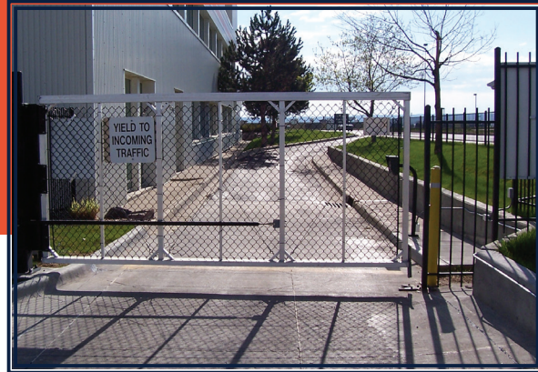
Fully integrated operator included.

Spans single clear opening widths up to 16 feet and double/bi-parting openings up to 32 feet.